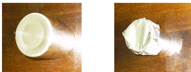
Fig. 2. Detector protection cap with- and without aluminum target foil.

I N principle, mono-isotopic mercury could be prepared by the same process used to enrich uranium. However, due to the military application of enriched uranium usage of such technology is closely monitored and thus not feasible without detection. Separation of isotopes by means of a magnetic field is an alternative, especially as only mg-quantities are needed anyway. Hereby, the same effects are used as in mass-spectroscopic measurement, and indeed it is possible and even easy to prepare mg samples of selected Hg-isotopes in the conventional mass spectrometer available in our laboratory anyway. The only modification required is the shielding of the detector with a target. The selected mercury isotopes will be implanted into the target and can be separated by standard chemical processes later. We managed to augment the build-in detector protection cap with an aluminum foil (Fig. 2). This foil can be changed via the sample door, thus not breaking the vacuum and allowing long up-times. The foil is irradiated with Hg after selecting an atomic mass of 203.97 and NOT removing the detector protection cap (See [2] for operator instructions). Afterwards, the foil is removed and dissolved. Run-times are long though, and over-night use is recommended. This also avoids exposure of the process to uninformed personnel.